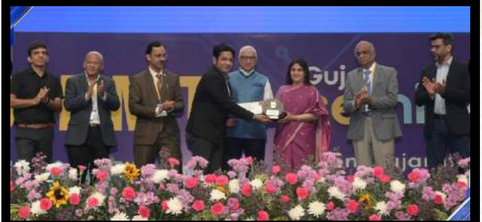
Inxee Systems Private Limited