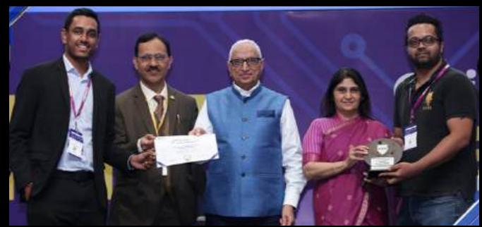
amPICQ Private Limited