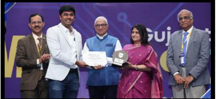
VLSI System Design

For Full IESA Vision Summit 2025 Report Contact: events@iesasonline.org